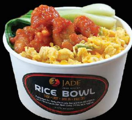
Nasi Ayam Rica 🌶️ Rp. 25.000