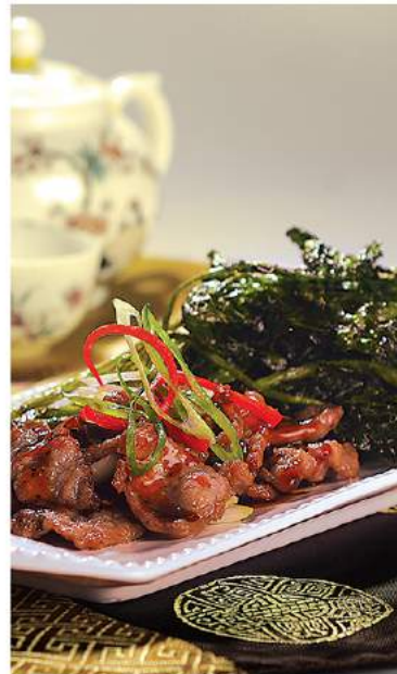
Sapi Lada Hitam Crispy CRISPY BLACK PEPPER BEEF Rp. 55.000