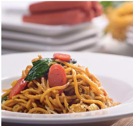
Bakmi Goreng Sosis STIR FRIED NOODLE WITH LUCKY COINS Rp. 27.000