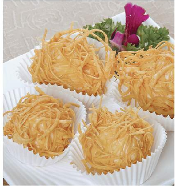
Udang Goreng Rambutan DEEP FRIED PRAWN BALLS Rp. 24.000