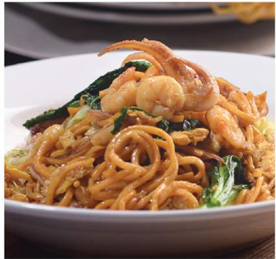
Bakmi Goreng Seafood STIR FRIED NOODLES WITH SEAFOOD Rp. 29.000