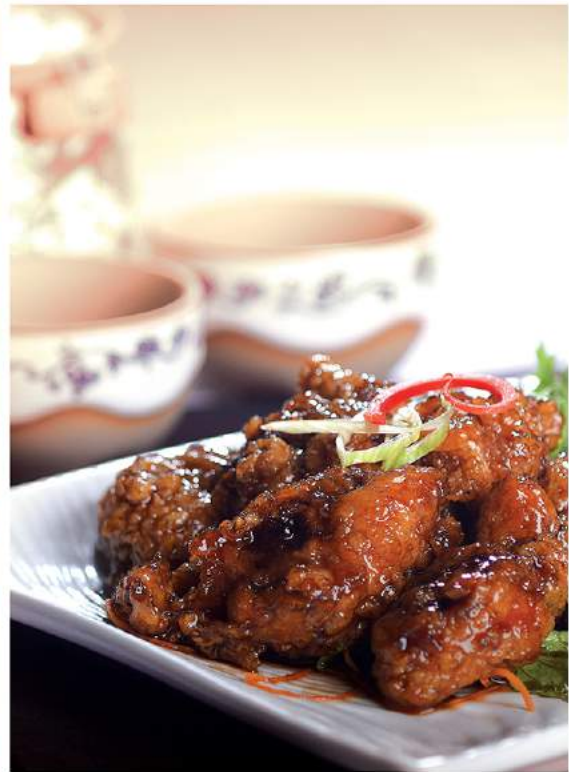
Ayam Saos Cenciang FRIED CHICKEN WITH CENCIANG BROWN SAUCE Rp. 44.000