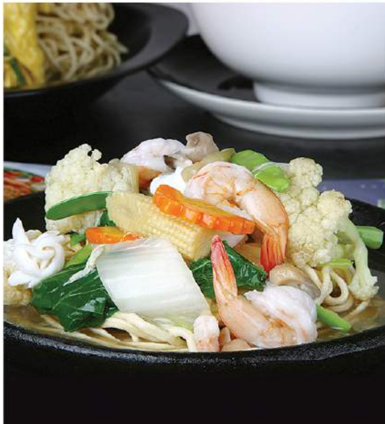
Hotplate Ifumie Seafood SIZZLING HOTPLATE EE FU NOODLES WITH BRAISED ASSORTED SEAFOOD Rp. 35.000