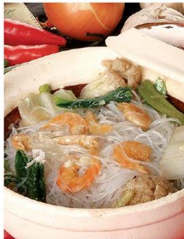
Sapo Cap Tjai Bihun BRAISED MIXED VEGETABLES OVER VERMICELLI IN CLAYPOT Rp. 35.000