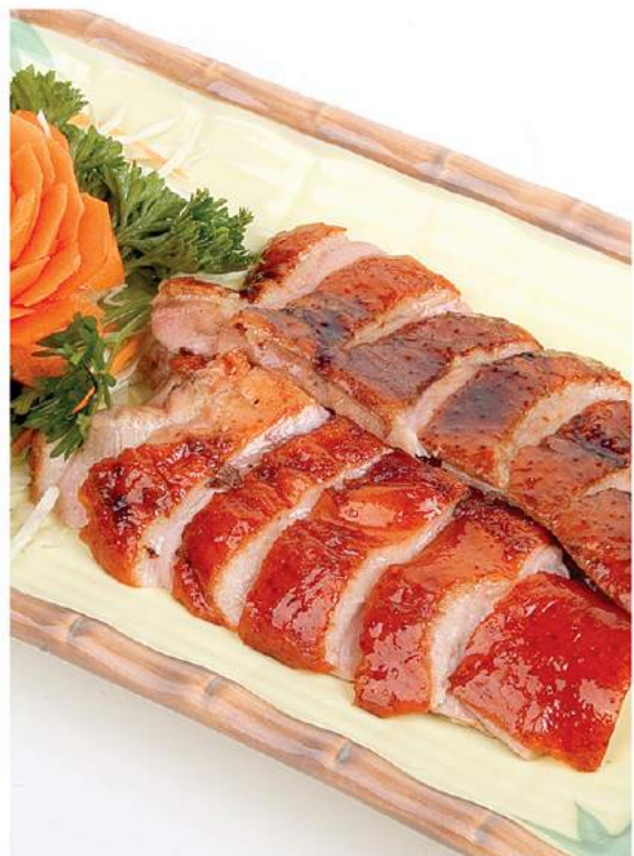
Bebek Panggang ROAST DUCK WITH SWEET AND SOUR SOUCE Rp. 65.000 / Porsi Rp. 190.000 1/2 e Rp. 360.000 1 e