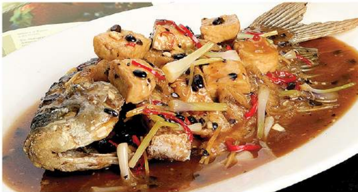
Gurami Tahu Taosi FRIED GURAME WITH BEANCURD BLACK BEAN SAUCE Rp. 20.000 / ons