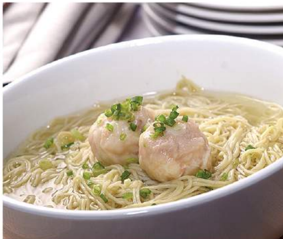
Bakmi Kuah Wonton WONTON HOMEMADE NOODLES SOUP Rp. 31.000