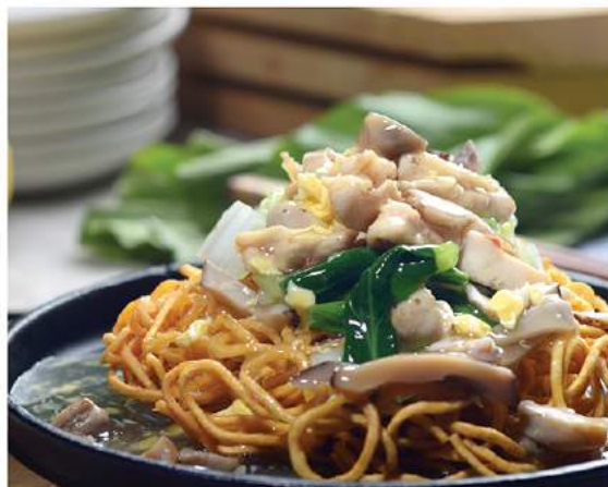
Hotplate Ifumie Ayam SIZZLING HOT PLATE EE FU NOODLES WITH BRAISED CHICKEN AND VEGETABLES Rp. 31.000