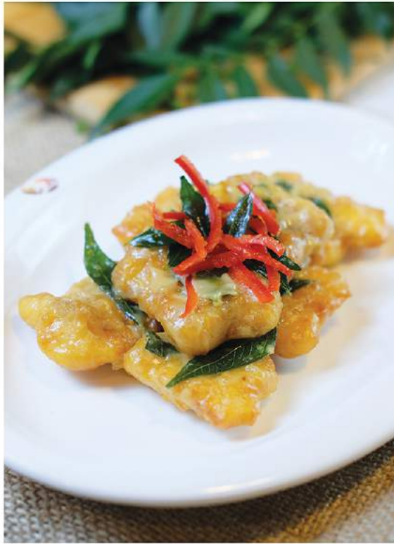
Dori Butter Susu BUTTER MILK FRIED DORY FISH Rp. 44.000