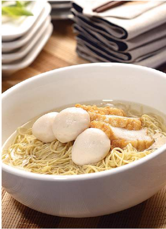
Bakmi Kuah Yubian & Bakso Ikan Singapore YUBIAN AND FISH BALL HOMEMADE NOODLE Rp. 38.000