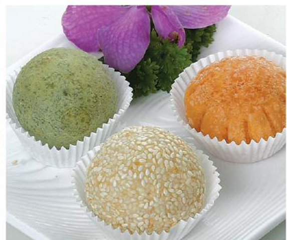
Onde - Onde 3 Rasa THREE FLAVOURS GLUTINOUS RICE BALL Rp. 19.000