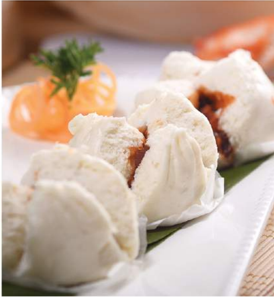
Bakpau Charsew CHAR SIEW STEAMED BUN Rp. 21.000