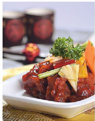
Ayam Asam Manis HUNAN STYLE FRIED CHICKEN Rp. 44.000