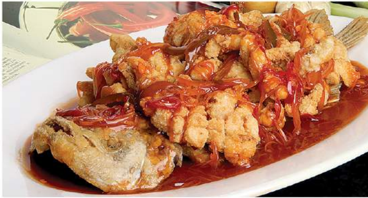
Gurami Asam Manis HUNAN STYLE FRIED GURAME Rp. 20.000 / ons