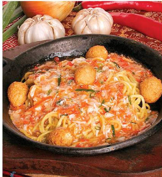
Hotplate Mie Telur Kepiting SWEET CRAB ROE HOTPLATE NOODLES Rp. 32.000