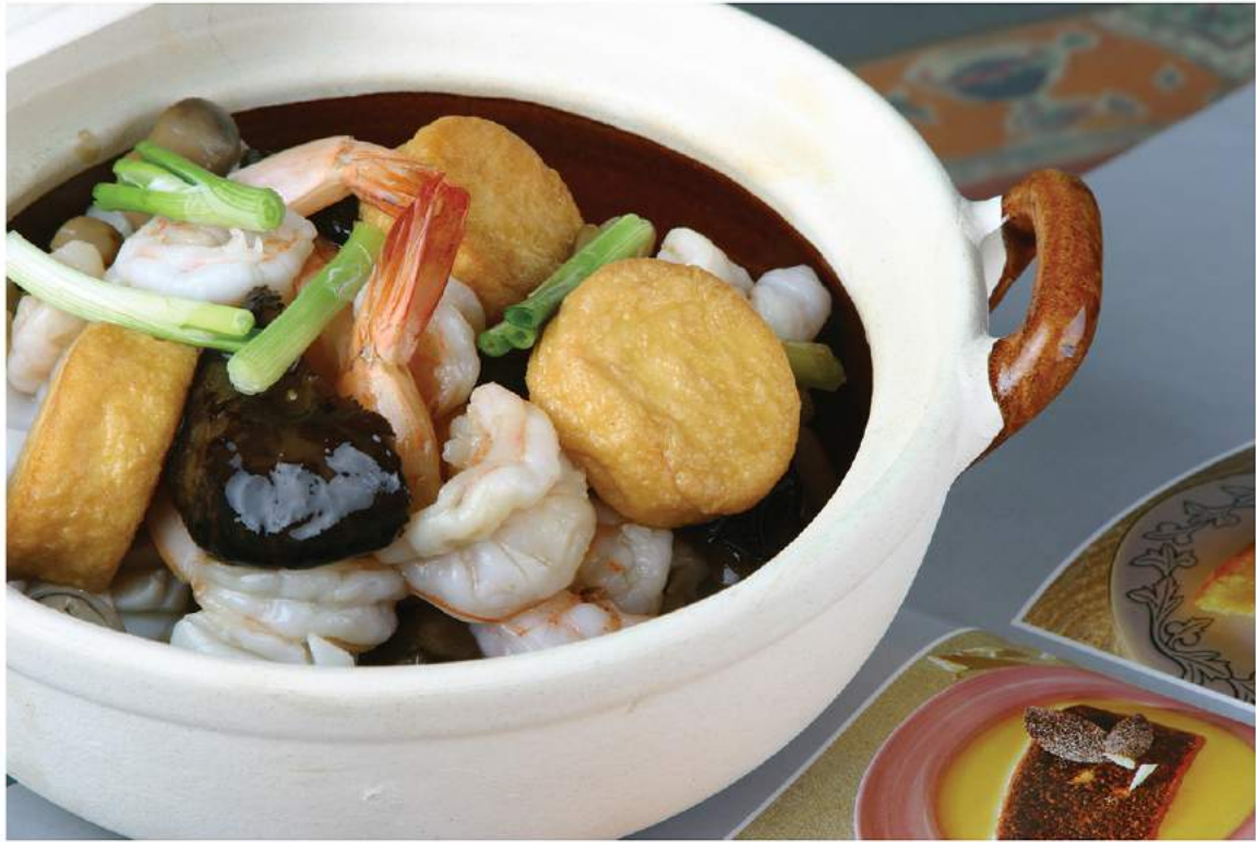
Sapo Tahu Jepang Seafood JAPANESE BEANCURD WITH SEAFOOD IN CLAYPOT Rp. 48.000