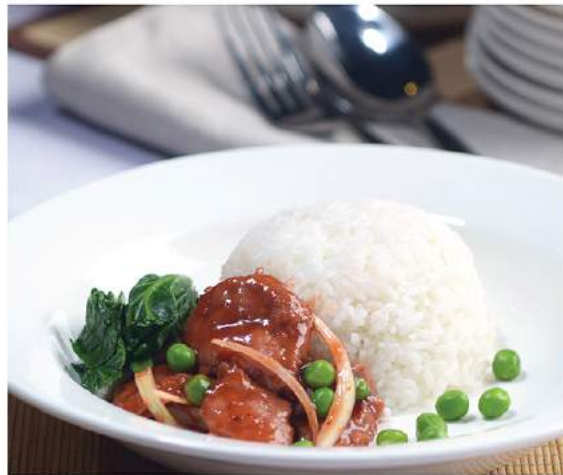
Nasi Sapi Canton CANTONESE SLICE BEEF SERVED WITH RICE Rp. 33.000