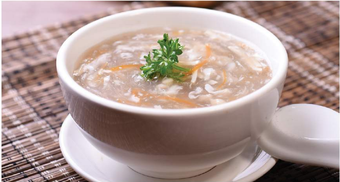
Sup Seafood SEAFOOD SOUP Rp. 35.000