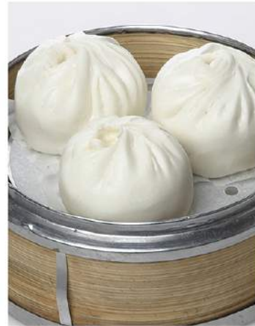
Bakpau Ayam Jamur CHICKEN MUSHROOM STEAMED BUN Rp. 20.000