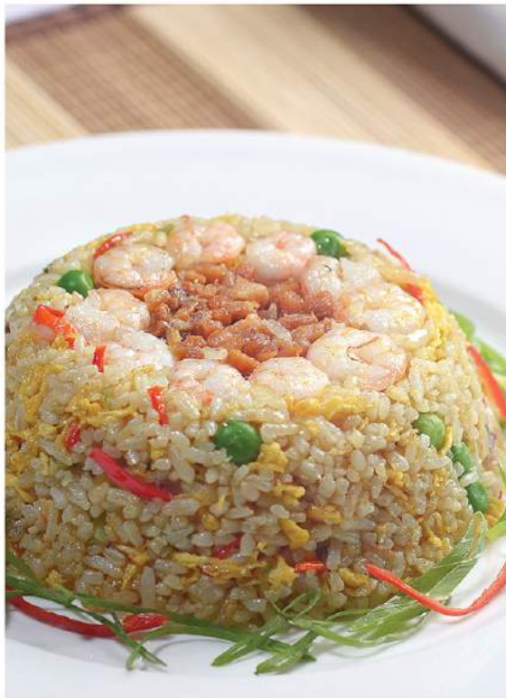
Nasi Goreng Ikan Asin SALTED FISH FRIED RICE Rp. 26.000