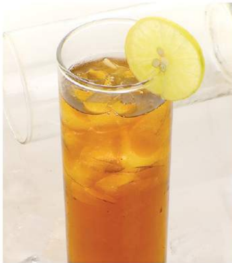
Lemon Tea (Hot/Ice) Rp. 13.000