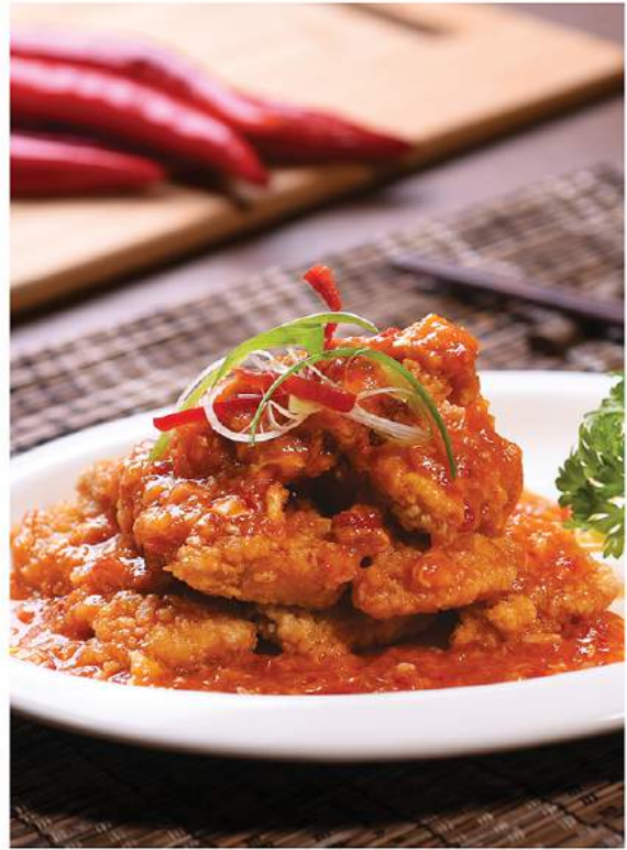
Kakap Saos Thailand THAILAND SAUCE FRIED SNAPPER Rp. 49.500