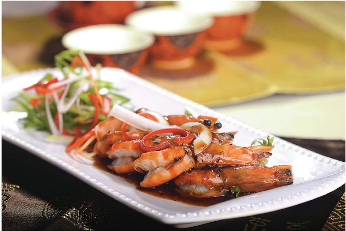
Udang Lada Hitam PAN FRIED BLACK PEPPER FRESH PRAWN Rp. 54.000