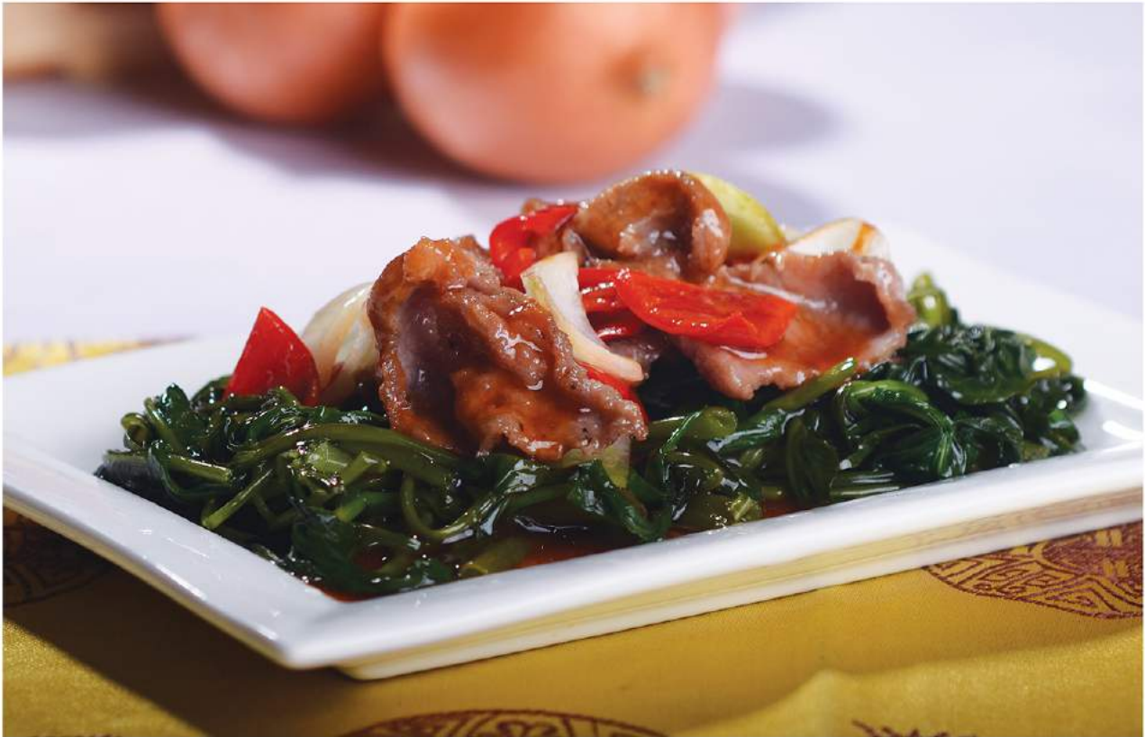
Kangkung Ca Sapi STIR FRIED WATER SPINACH WITH SLICE BEEF Rp. 37.000