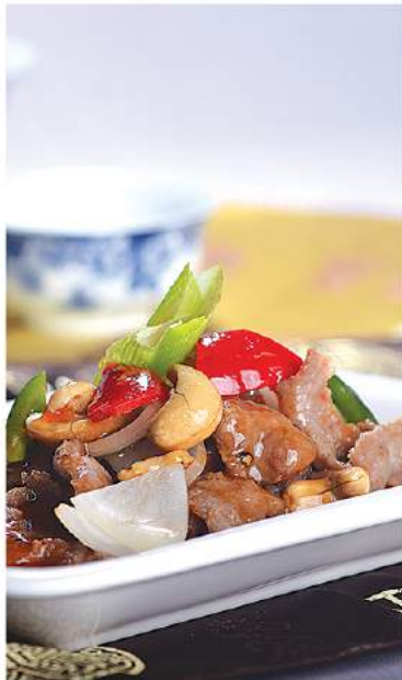
Sapi Ca Mete PAN FRIED BEEF SLICE WITH CASHEWNUT Rp. 55.000