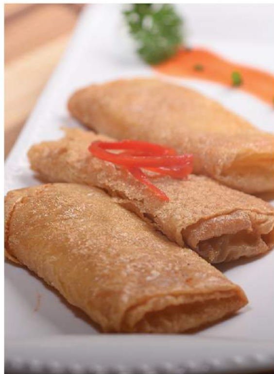
Lumpia Udang Kulit Tahu FRESH SHRIMP ROLLED IN CRISPY BEANCURD SKIN Rp. 28.000