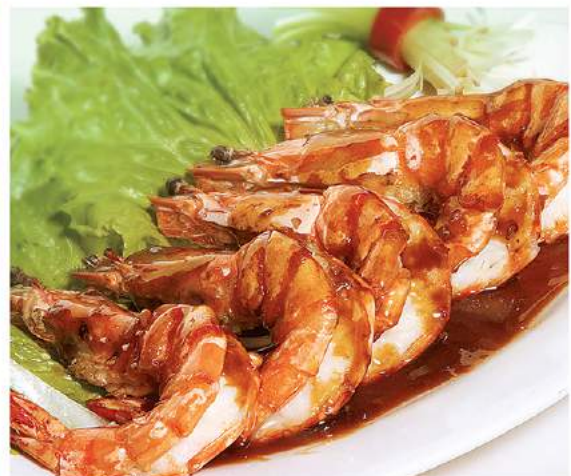
Udang Goreng Mentega BUTTER SAVORY FRIED PRAWN Rp. 54.000