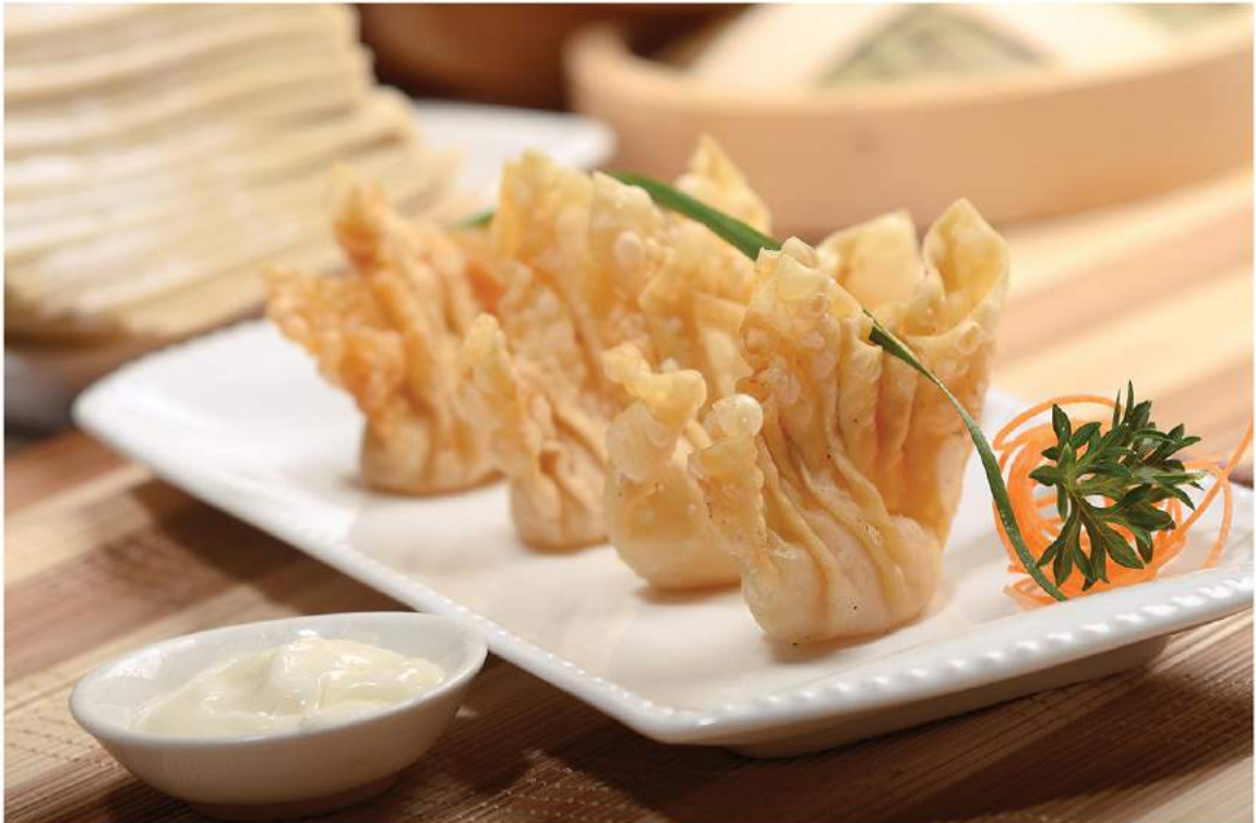
Salad Udang CRISPY PRAWN SALAD Rp. 28.500