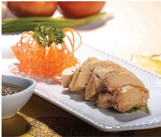
Ayam Rebus DOUBLE BOILED SUPERIOR STEAMED SOYA CHICKEN Rp. 70.000 1/2 e Rp. 130.000 1 e