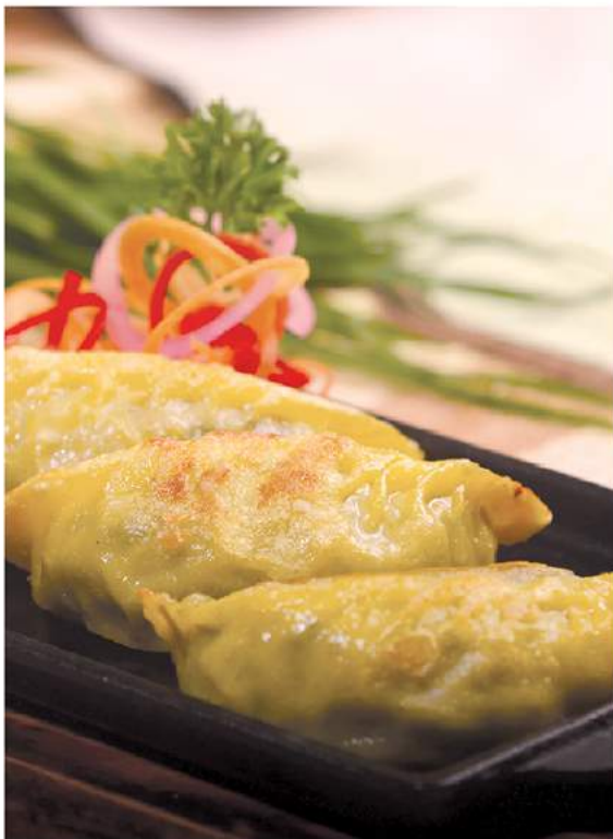
Wotie ala Canton CANTONESE WOTIE Rp. 17.500