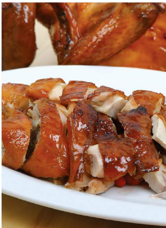
Ayam Panggang HONG KONG STYLE ROASTED CHICKEN Rp. 52.000 / Porsi Rp. 85.000 1/2 e Rp. 168.000 1 e