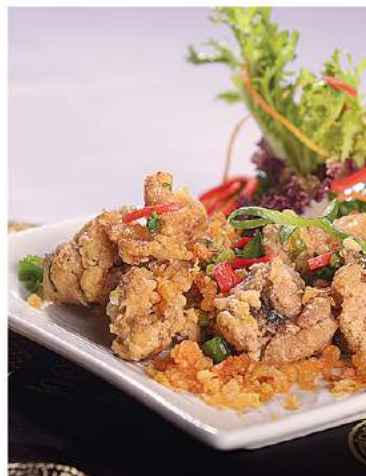
Ayam Goreng Kering Oriental ORIENTAL CRISPY FRIED CHICKEN Rp. 44.000