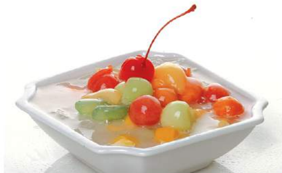
Es Buah Sirsak Rp. 25.000