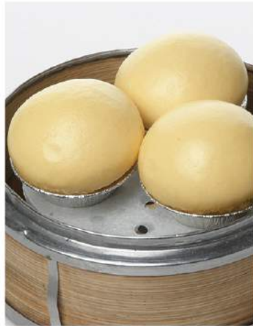
Bakpau Melting Gold MELTING GOLD CHINESE BUN Rp. 21.000