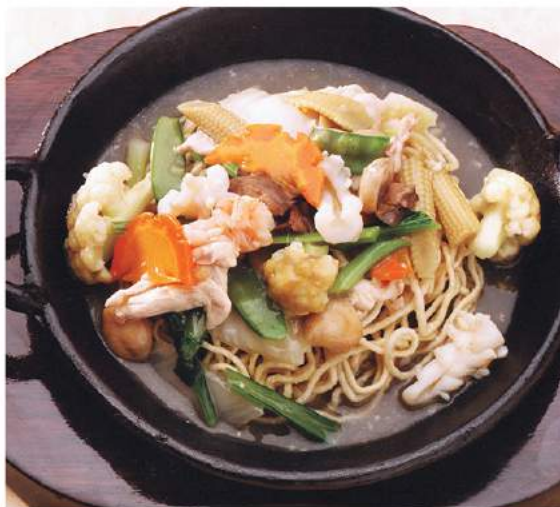
Hotplate Ifumie Cap Tjai SIZZLING HOT PLATE EE FU NOODLES WITH BRAISED MIXED VEGETABLES Rp. 32.000