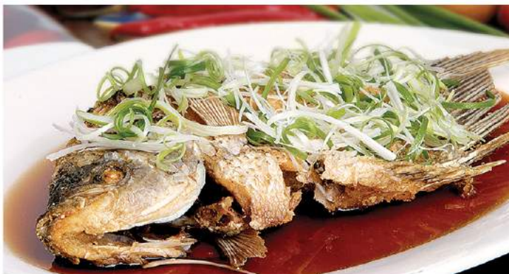
Gurami Saos Soya FRIED GURAME IN SUPERIOR SOYA SAUCE Rp. 20.000 / ons