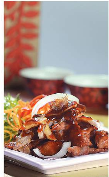
Sapi Vietnam WOK FRIED BEEF WITH VIETNAMESE SAUCE Rp. 55.000