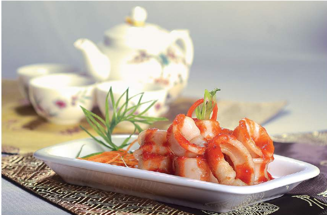
Cumi Saos Cabe PAN FRIED CUTTLEFISH IN HOMEMADE SPICY SAUCE Rp. 49.500