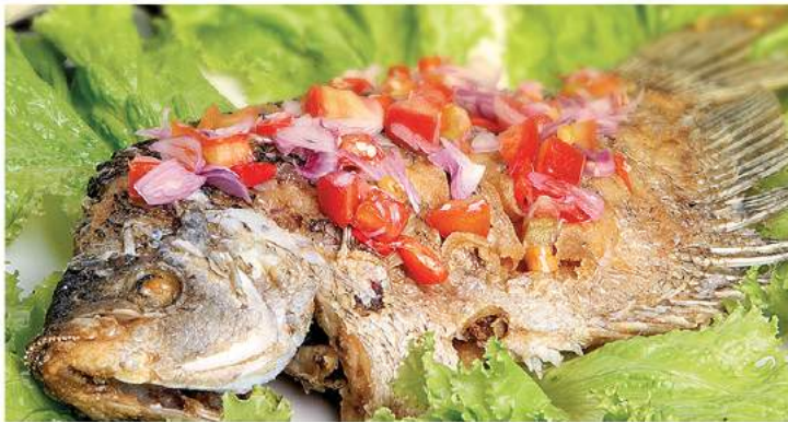
Gurami Sambal Manado SPICY MANADO STYLE FRIED GURAME Rp. 20.000 / ons