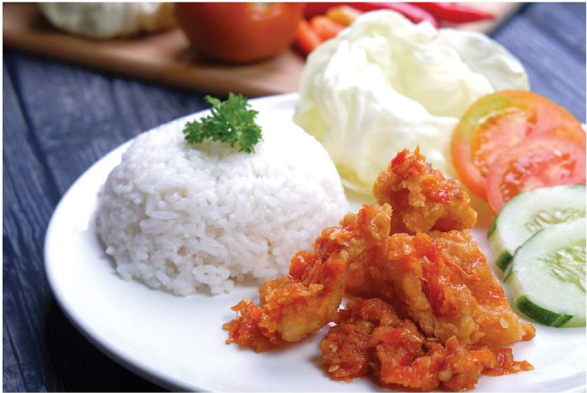
Nasi Ayam Geprek Rp. 25.000