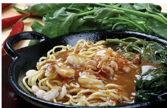
Hotplate Mie Kangkung Seafood SIZZLING HOT PLATE NOODLES WITH ASSORTED SEAFOOD & WATER SPINACH Rp. 28.000