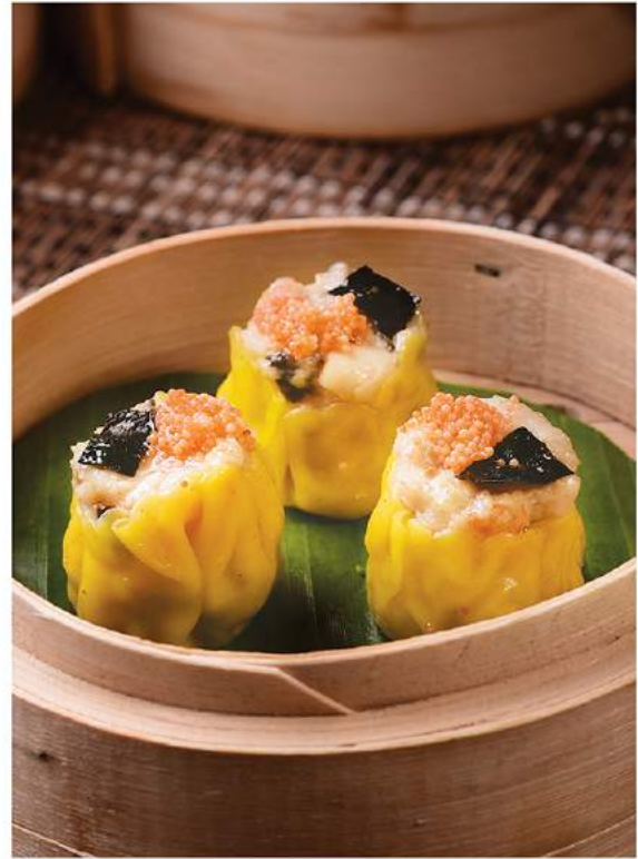
Siomay Seafood SIOMAY SEAFOOD Rp. 24.000