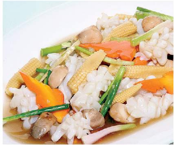
Cumi Jagung Muda STIR FRIED CUTTLEFISH WITH BABY SWEET CORN Rp. 49.500