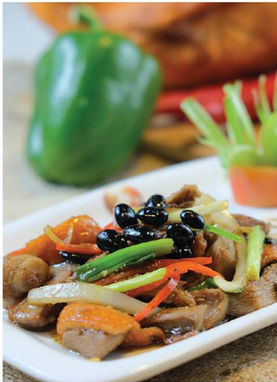
Bebek Taosi BLACK BEAN SAUCE PEKING DUCK Rp. 75.000