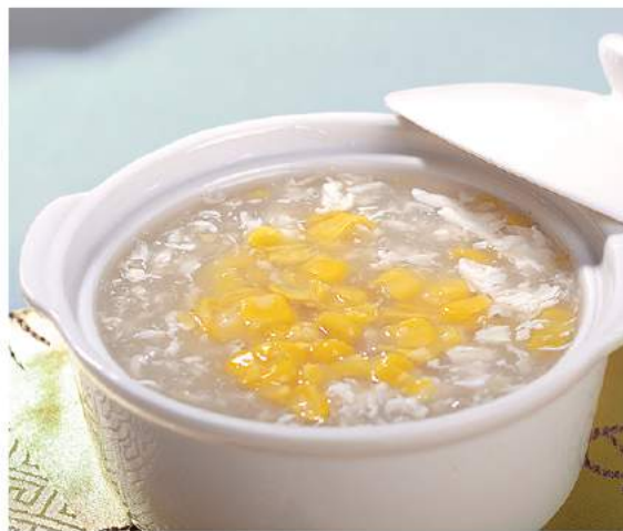
Sup Jagung Ayam SWEET CORN SOUP WITH MINCED CHICKEN Rp. 18.000