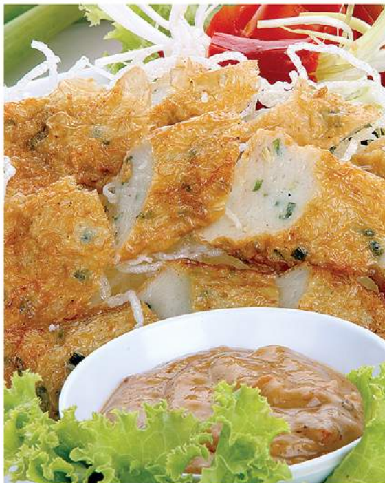
Otak otak Tenggiri ORIENTAL FRIED FISH CAKE Rp. 37.000