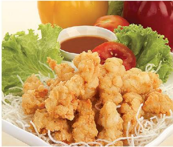
Cumi Goreng Tepung CRISPY BATTERED PRAWN Rp. 49.500