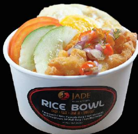
Nasi Dory Sambal Matah 🌶️ Rp. 27.000