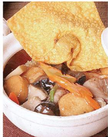
Nasi Sapo Kakap SNAPPER CLAYPOT RICE Rp. 35.000