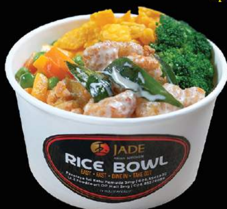
Nasi Dory Butter Susu Rp. 27.000