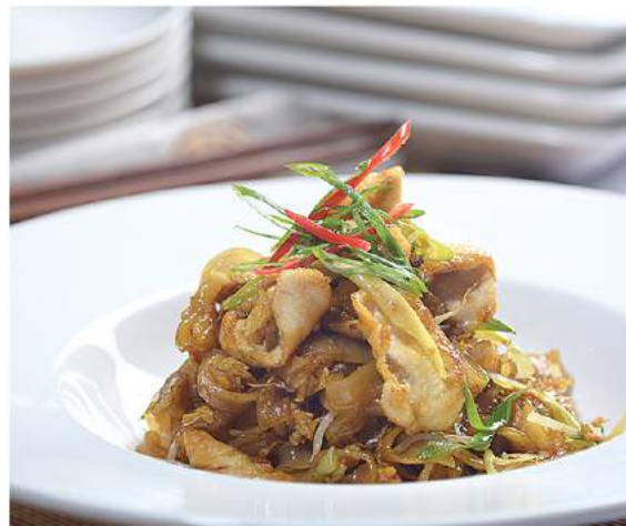
Kweetiau Goreng Ayam STIR FRIED RICE NOODLES WITH CHICKEN CUBE Rp. 30.000