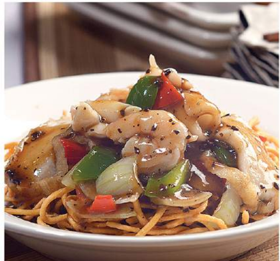
Ifumie Siram Seafood Lada Hitam BRAISED BLACK PEPPER SEAFOOD EE FU NOODLES Rp. 33.500