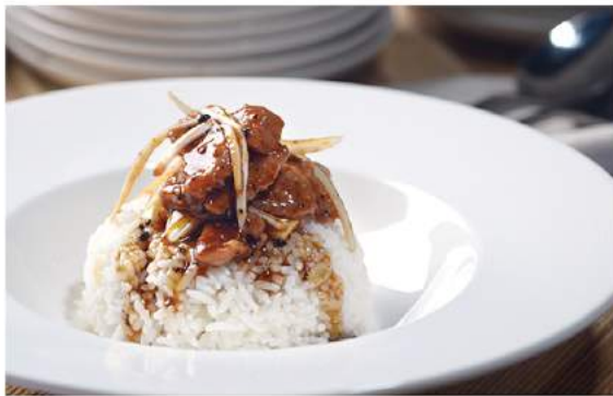
Nasi Siram Sapi Lada Hitam BRAISED SLICE BEEF BLACK PEPPER OVER RICE Rp. 33.000