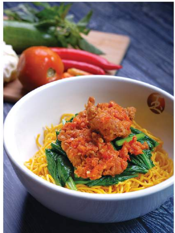
Mie Dori Geprek Rp. 30.000