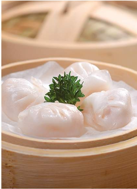
Hakau SHRIMP DUMPLING Rp. 25.000