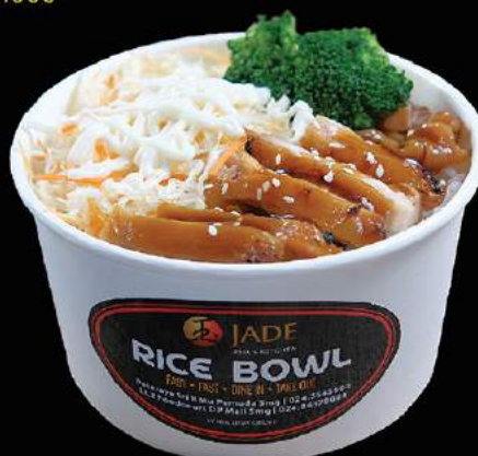
Nasi Ayam Teriyaki Rp. 25.000