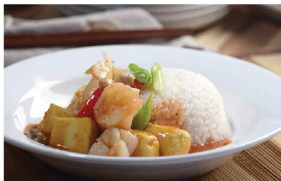
Nasi Siram Seafood Tahu BRAISED ASSORTED SEAFOOD BEANCURD OVER RICE Rp. 33.000