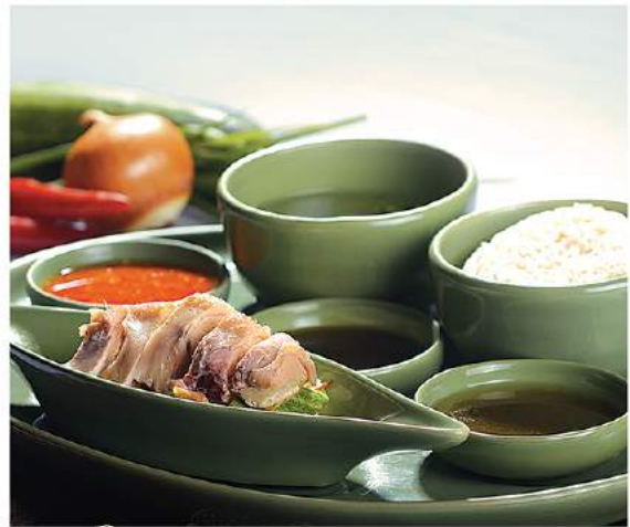
Nasi Hainan Ayam Rebus HAINANESE STEAMED CHICKEN RICE Rp. 32.000