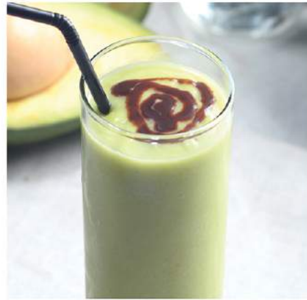
Avocado Juice Rp. 21.000