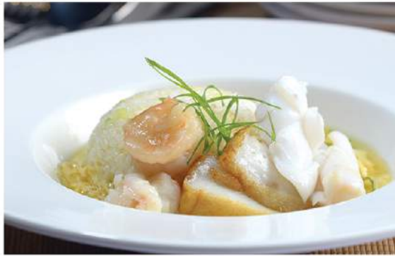
Nasi Siram Seafood Telur SHREDDED EGG BRAISED SEAFOOD OVER RICE Rp. 33.000