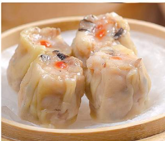
Siomay Ayam CHICKEN SIEW MAI Rp. 21.000