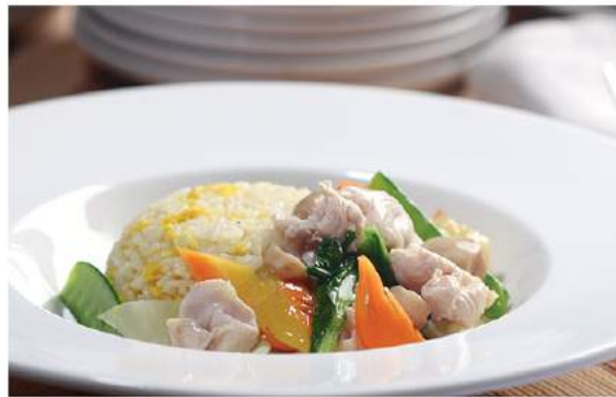
Nasi Cap Tjai Ayam STIR FRIED CHICKEN MIXED VEGETABLES SERVED WITH RICE Rp. 29.000