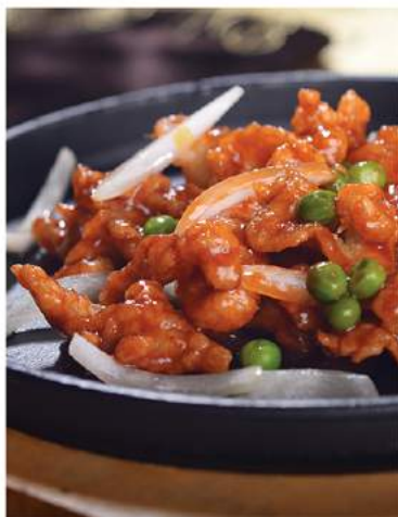
Bistik Ayam CHINESE STYLE CHICKEN STEAK Rp. 44.000