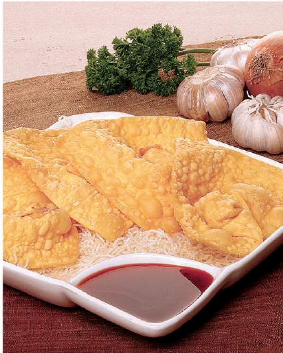
Pangsit Goreng CRISPY CHICKEN DUMPLING WITH SWEET & SOUR SAUCE Rp. 28.000