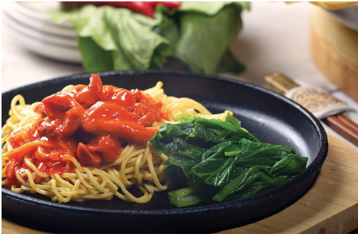
Hotplate Mie Ayam Szechuan SZECHUAN CHICKEN HOTPLATE NOODLES Rp. 29.000