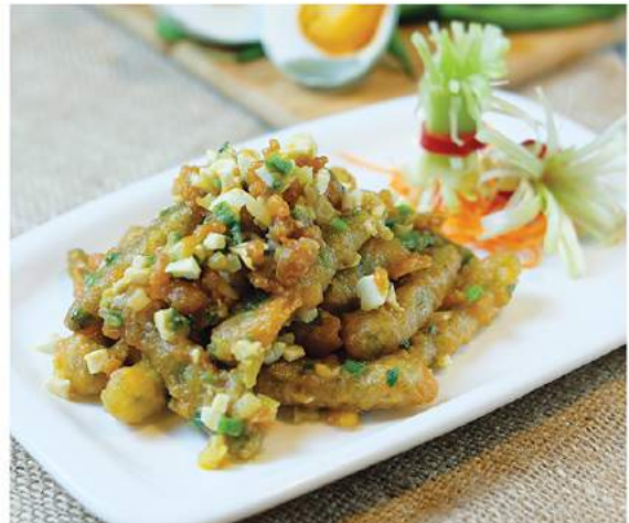
Dori Telur Asin SALTED EGG FRIED DORY FISH Rp. 44.000