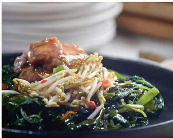
Hotplate Kangkung Sapi STIR FRIED WATER SPINACH WITH SLICE BEEF SERVED ON HOT PLATE Rp. 38.500