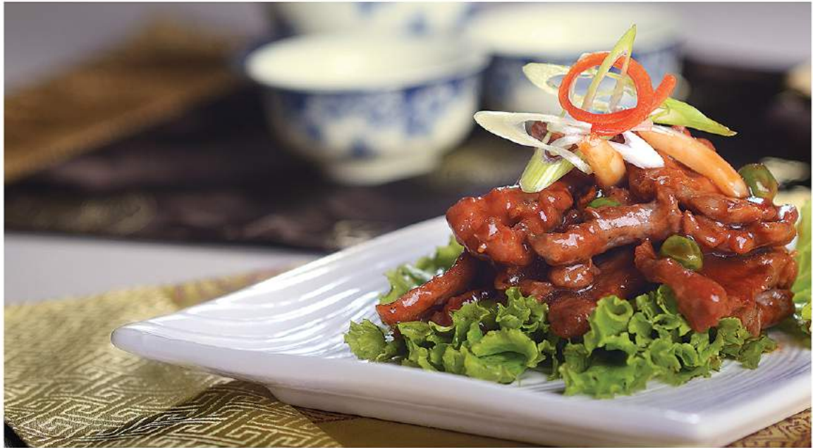
Sapi ala Canton CANTONESE SLICE BEEF Rp. 55.000