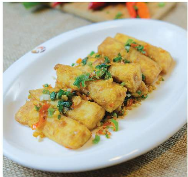
Tahu Jepang Cabe Garam CHILI AND SALT JAPANESE BEANCURD Rp. 26.000