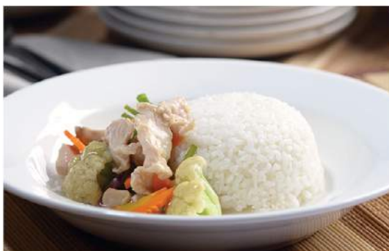
Nasi Siram Ayam Jarnur BRAISED MUSHROOM CHICKEN SLICE OVER RICE Rp. 29.000