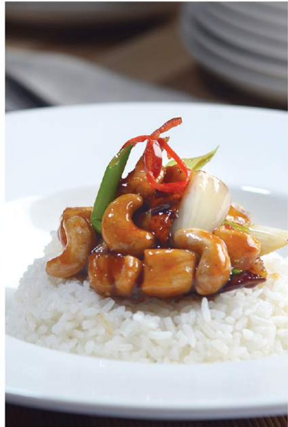
Nasi Ayam Kung Pao KUNG PAO CHICKEN SERVED WITH RICE Rp. 33.000