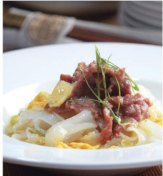
Kweetiau Siram Sapi Telur BRAISED SLICE BEEF WITH SHREDDED EGGOVER RICE NOODLES Rp. 35.000