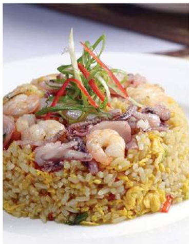
Nasi Goreng Seafood SEAFOOD FRIED RICE Rp. 26.000