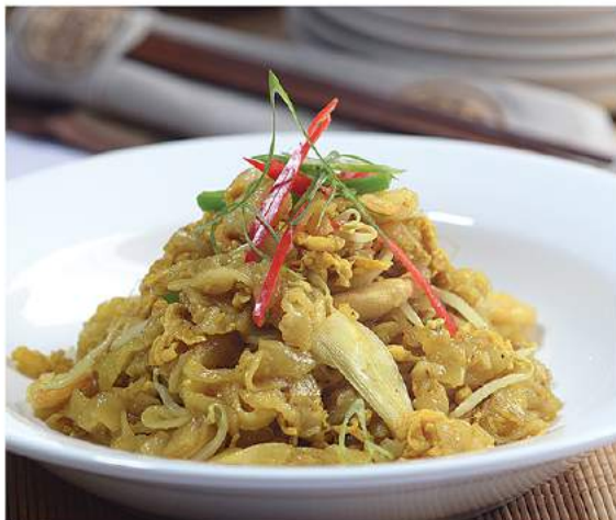
Kweetiau Goreng Kare CURRY FLAVOR FRIED RICE NOODLES WITH VEGETABLES Rp. 32.500