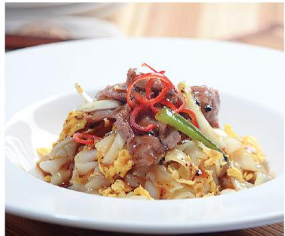
Kweetiau Siram Sapi Lada Hitam SLICE BEEF BLACK PEPPER SAUCE OVER RICE NOODLES Rp. 32.500