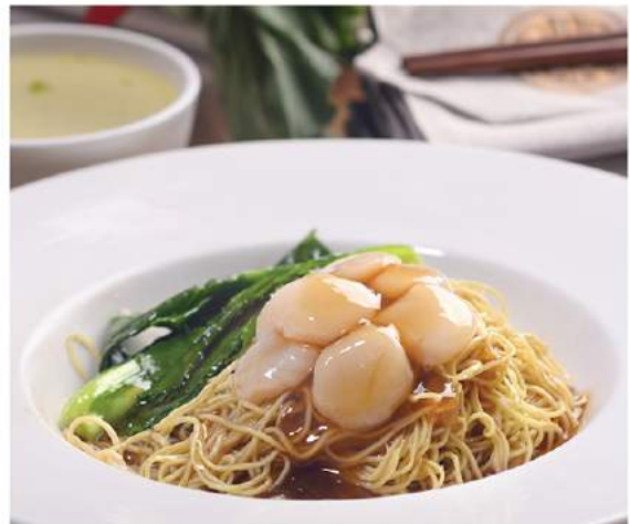
Bakmi Scallop HK HK STYLE SCALLOP OVER NOODLES Rp. 35.500