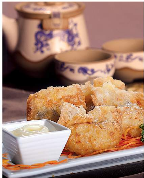
Swekiau Goreng Mayo CRISPY FRIED SWEKIAU SERVED WITH MAYONNAISE Rp. 37.000