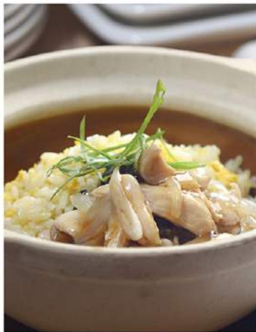
Nasi Sapo Ayam CHICKEN CLAYPOT RICE Rp. 34.000