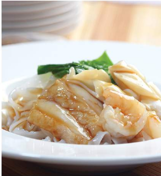
Kweetiau Siram Seafood OVER RICE NOODLE WITH SEAFOOD Rp. 37.000