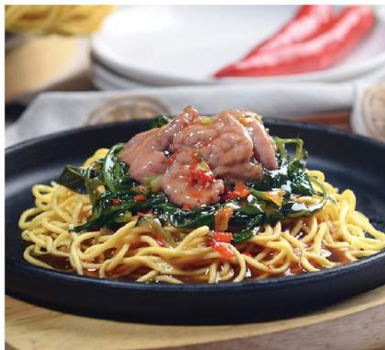
Hotplate Mie Kangkung Sapi SIZZLING HOT PLATE NOODLES WITH SLICE BEEF AND WATER SPINACH Rp. 33.000