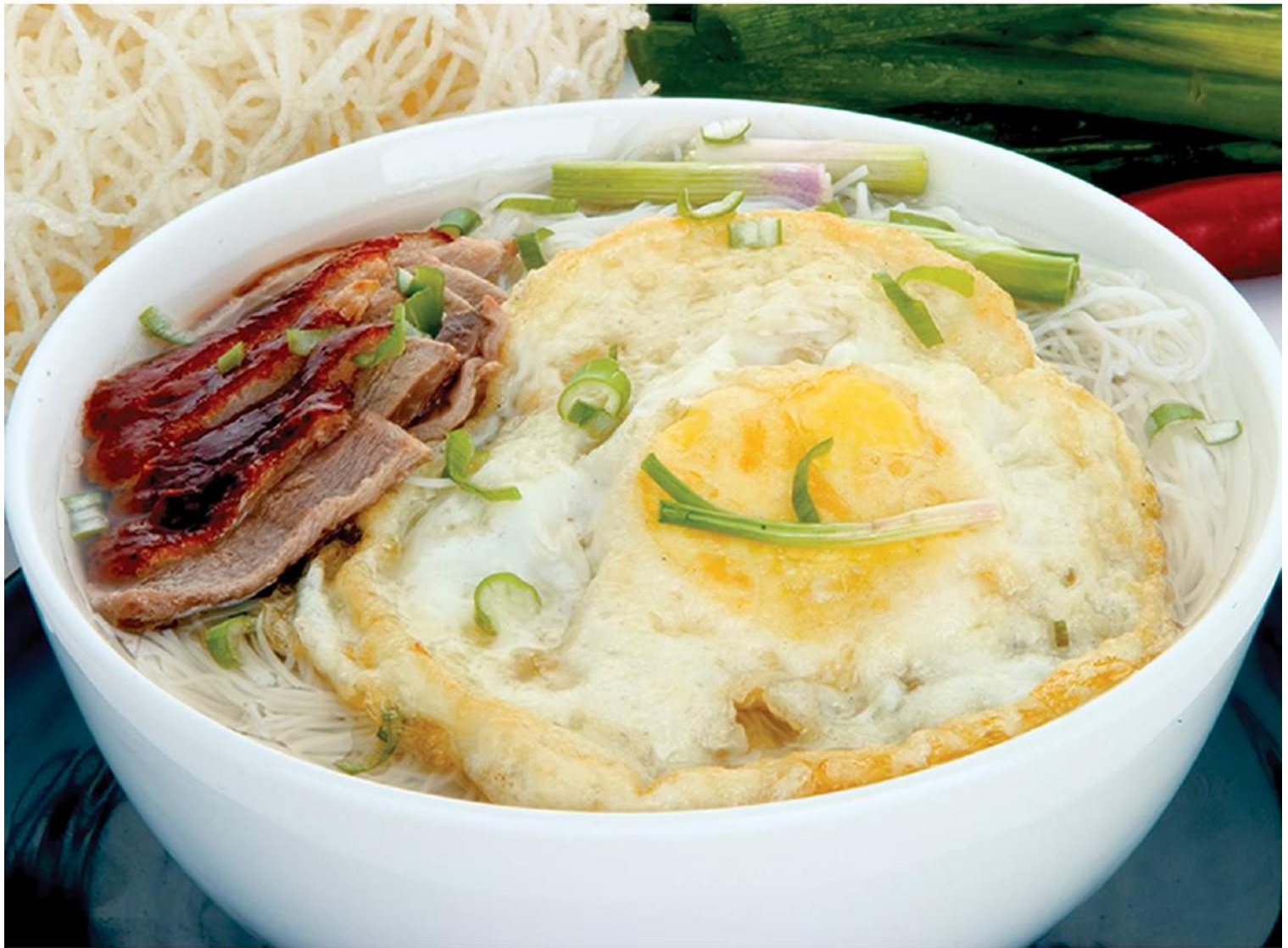
Bihun Kuah Singapore Bebek Peking SINGAPORE STYLE BEE HOON SOUP WITH ROASTED PEKING DUCK Rp. 39.000