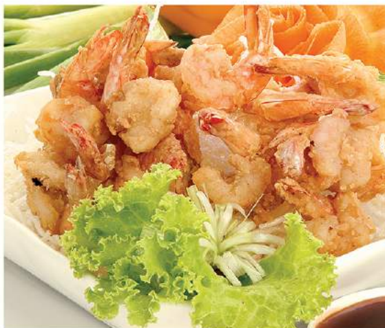
Udang Goreng Tepung CRISPY BATTERED PRAWN Rp. 49.500