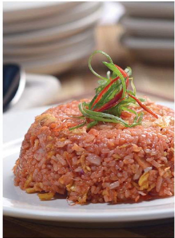
Nasi Goreng Merah RED ORIENTAL FRIED RICE Rp. 23.000