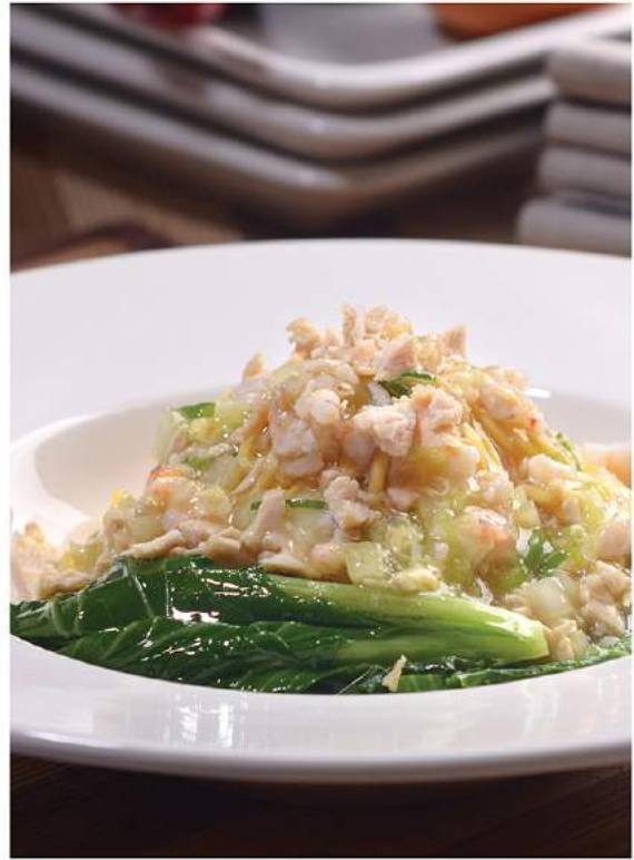
Lo Mie BRAISED MINCED CHICKEN & PRAWN OVER NOODLES Rp. 32.000