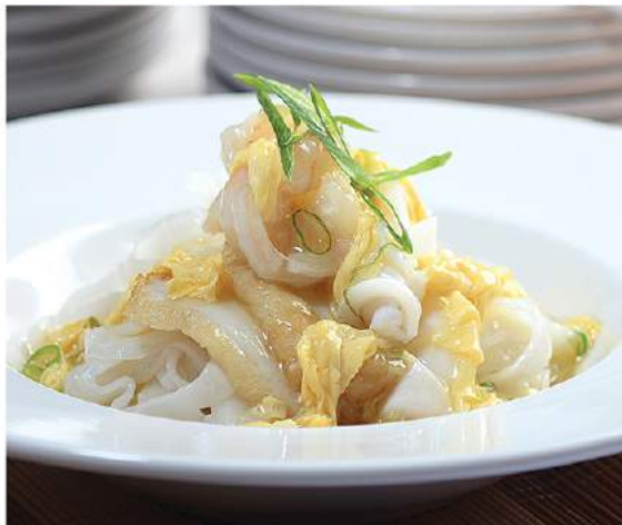
Kweetiau Siram Udang Telur BRAISED PRAWN WITH SHREDDED EGGOVER RICE NOODLES Rp. 36.000