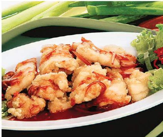
Kakap Asam Manis HUNAN STYLE FRIED SNAPPER Rp. 49.500