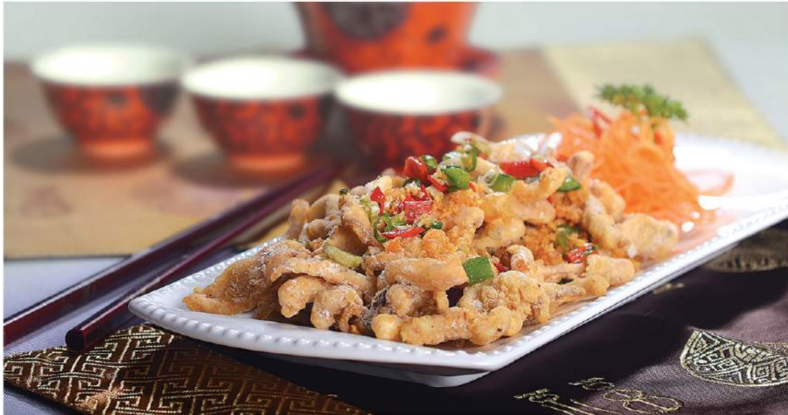
Cumi Goreng Kering Oriental ORIENTAL CRISPY FRIED SQUID Rp. 49.500