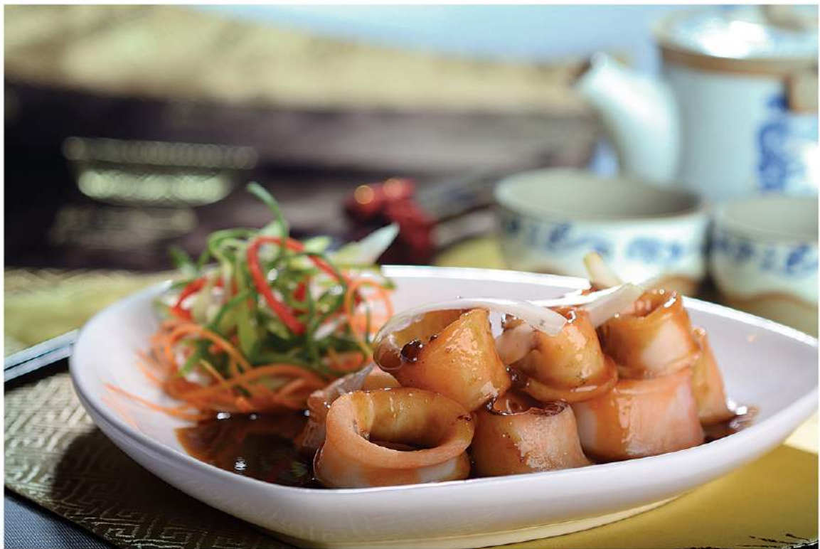
Cumi Saos Mentega BUTTER SAVORY FRIED CUTTLEFISH Rp. 49.500