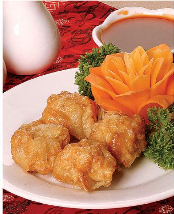
Wonton Goreng Hongkong HONGKONG STYLE FRIED WONTON Rp. 35.000