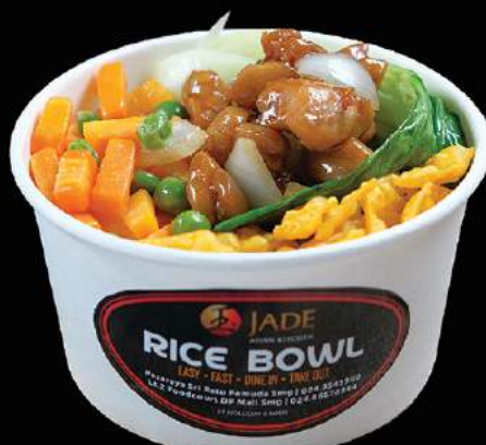
Nasi Ayam Saus Inggris 🌶️ Rp. 25.000