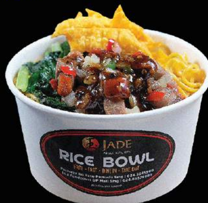
Mie Ayam Lada Hitam 🌶️ Rp. 25.000