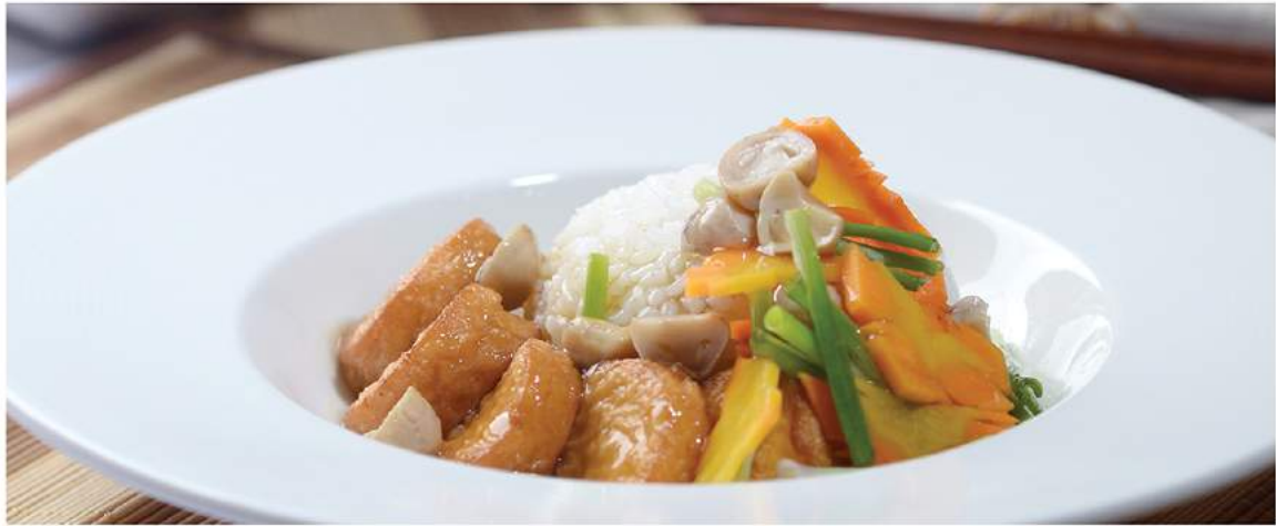
Nasi Siram Tahu Jepang JAPANESE BEANCURD OVER RICE Rp. 29.000