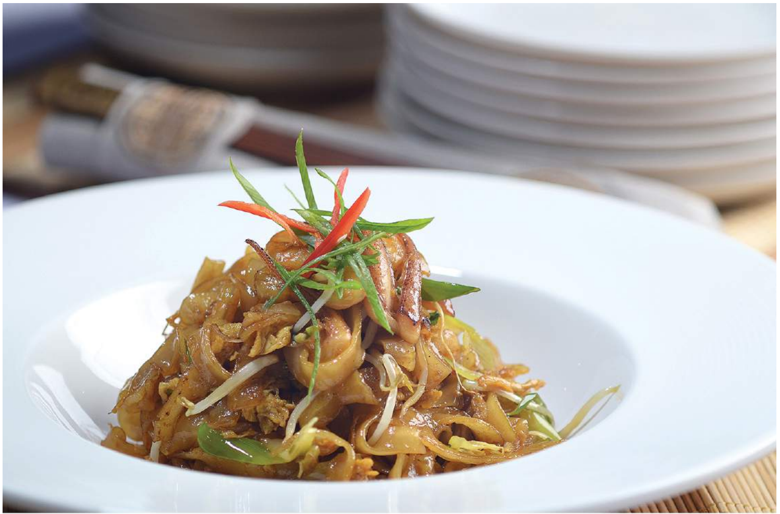
Kweetiau Goreng Seafood STIR FRIED RICE NOODLES WITH SEAFOOD Rp. 32.500