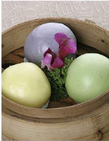
Bakpau 3 Rasa THREE FLAVOURS CHINESE BUN Rp. 18.500