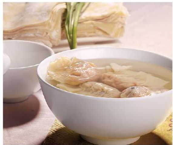
Sup Swekiauw SWEKIAU SOUP Rp. 35.000