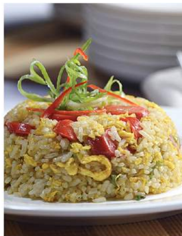
Nasi Goreng Sosis RED LUCKY COIN FRIED RICE Rp. 25.000