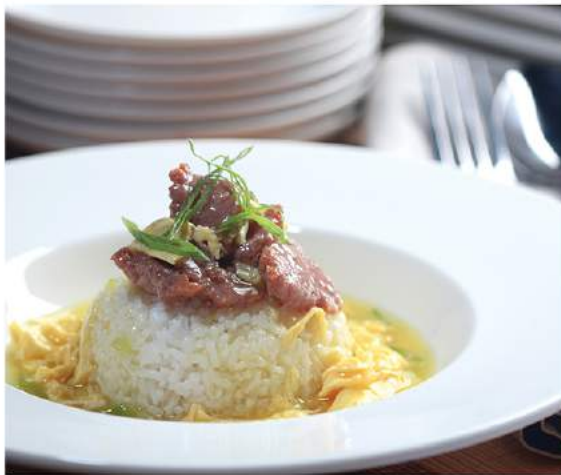
Nasi Siram Sapi Telur BRAISED SLICE BEEF WITH SHREDDED EGG OVER RICE Rp. 33.000