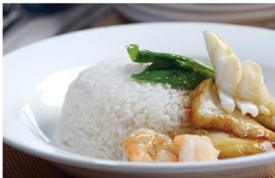
Nasi Siram Seafood Saos Tiram OYSTER SAUCE SEAFOOD OVER RICE Rp. 33.000