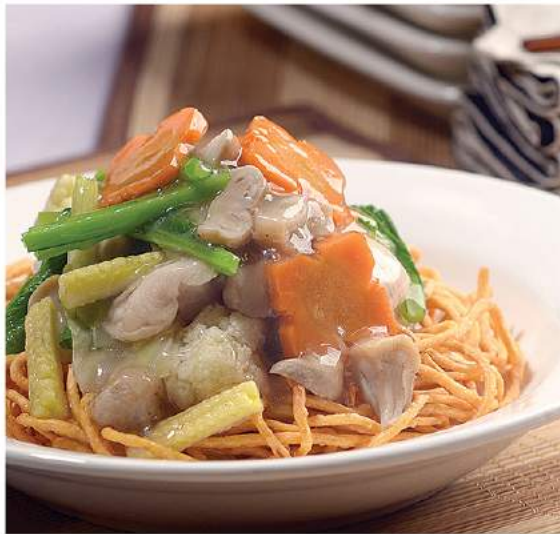
Ifumie Siram Cap Tjai STIR FRIED MIXED VEGETABLES EE FU NOODLES Rp. 31.000