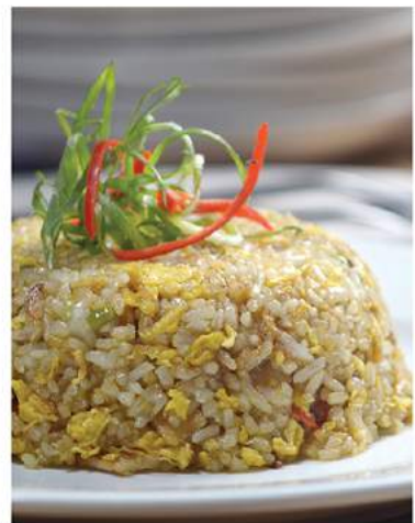
Nasi Goreng Terasi SHRIMP PASTE FRIED RICE WITH SHREDDED GOLDEN EGG Rp. 25.000